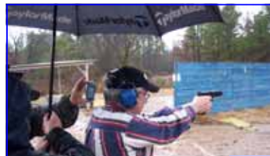
December 2007- Rain Match Yes, we do shoot in the rain at CASA.