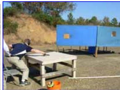
November 2007 Hillbilly Classic